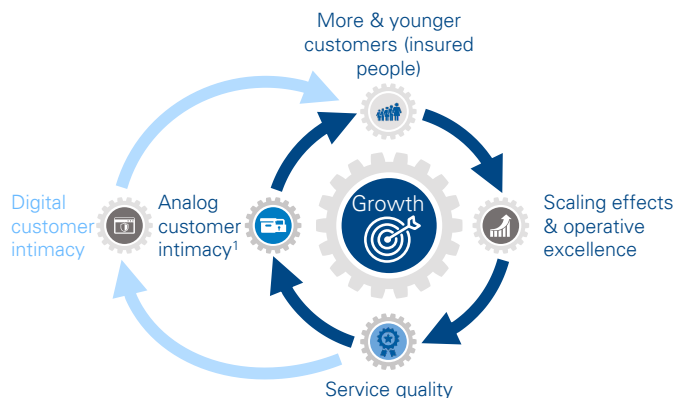
1 Starting point

To convey the flywheel concept, we use a client’s flywheel in the insurance sector: